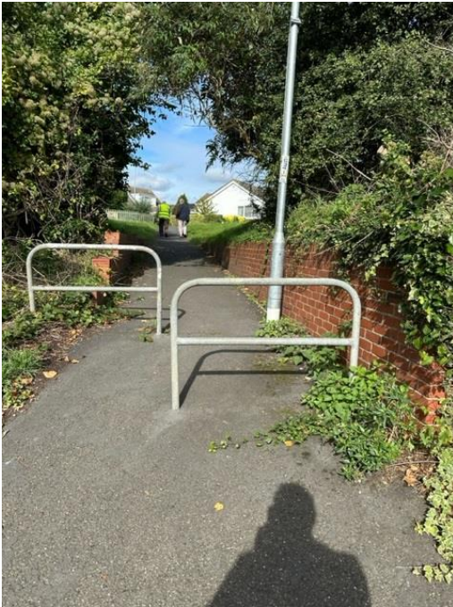
10. Footpath Left from B1115 in Stowmarket. Prior to Footpath left no left turns off B1115 for traffic or pedestrians.