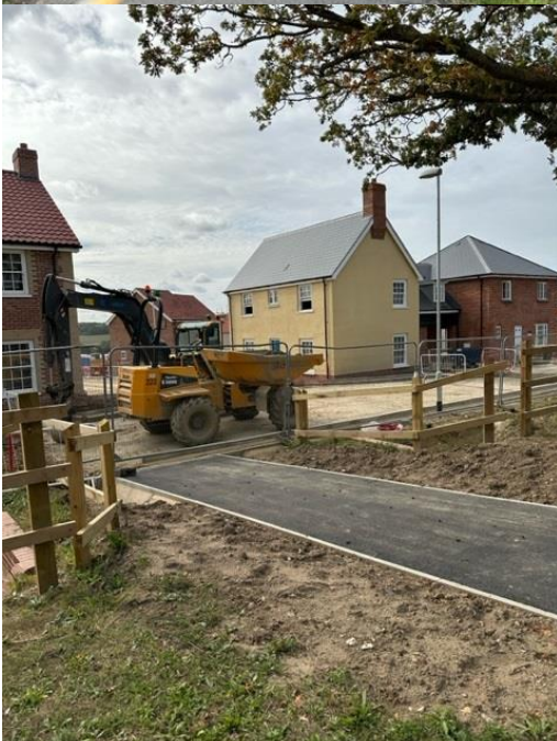
12. Union Road, Stowmarket. Union Road Development just inside Stowmarket.