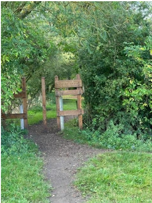
17. Boundary Stowmarket and Onehouse - Entrance Paupers Grave Onehouse.

North facing in direction of new development in Stowmarket.