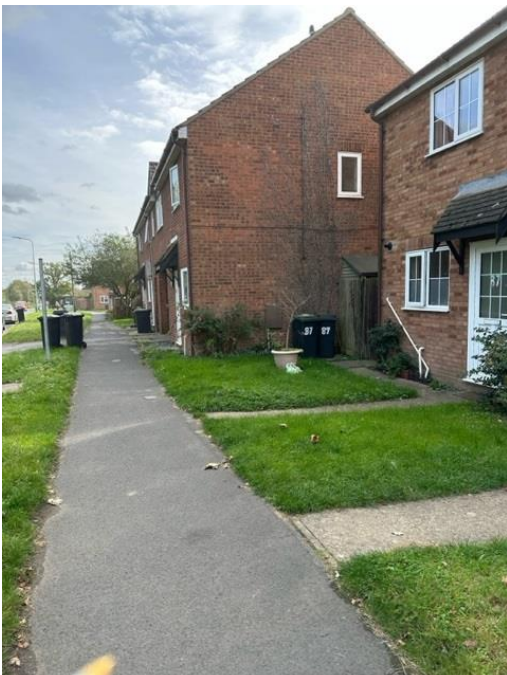
11. Union Road. Stowmarket. East facing in direction of Stowmarket. These existing residences already in Stowmarket (not part on new development at Union Road).