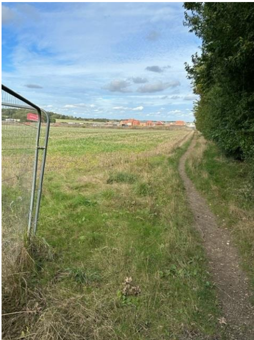
16. Boundary Stowmarket and Onehouse just past Chilton Fields.

North facing in direction of new development in Stowmarket.