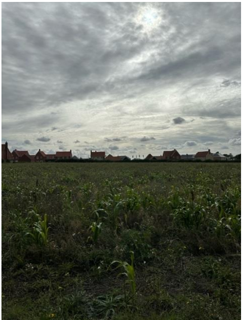
18. Paupers Grave Onehouse.

South facing towards new developments in direction of Union Road - In the foreground is open space with no development in the next 5 years.